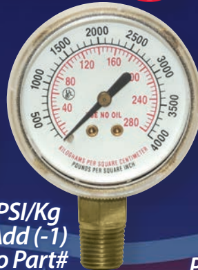
PSI/Kg Add (-1) to Part#