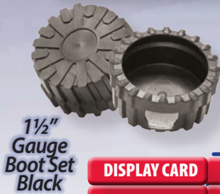
1 1/2" Gauge Boot Set Black

B.M. = Bottom Mount. C.B.M. = Center Back Mount. * With Gauge Boot. ** For 1/8" NPT add [-4] to Part Number.