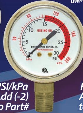
PSI/kPa Add (-2) to Part#