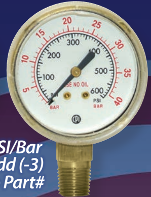
PSI/Bar Add (-3) to Part#