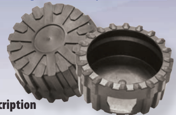
GB20S 2" Gauge Boot Set Black